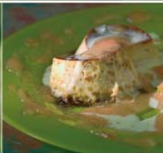
* Creams caramel mufin with Bierzo confiture pear.

All the pears that reach the consumer contain a small sticky label which signals the official guarantee of quality. Only this label assures that the pears purchased are controlled and certified to the highest possible standards.