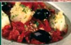
* Cod salad with roasted peppers from Bierzo.

A typical product of Bierzo which the housewives have helped to convert into a symbol of the region. Pilgrims on their way to Santiago sing the praises of this delicacy and its fame spreads far and wide.