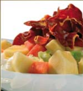
* Reina apple salad from Bierzo

The Reineta variety presents various distinguishing features. Externally the fruit is oval shaped, wide at the base and with a short stalk. When harvested its colour is a dull green with a characteristic matt brown speckling (Russeting) which immediately distinguishes it from other varieties of Reineta.